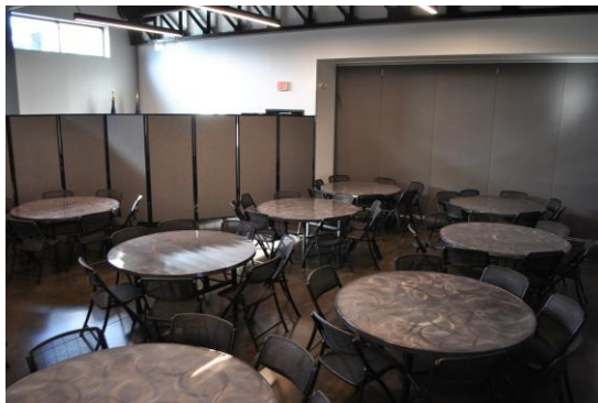
Council Chambers/Party Room