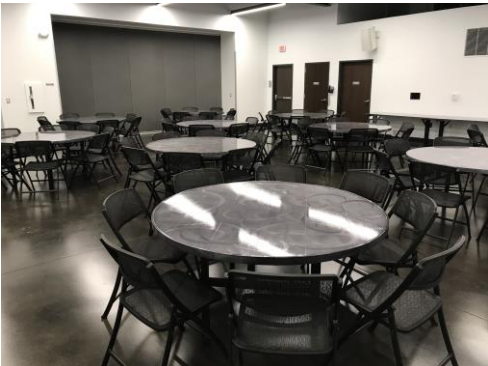
Multipurpose Room (MPR)

List all third-party vendors (if applicable): _____